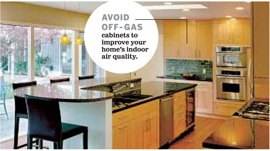
DOUGLAH DESIGNS INC. FROM NEW KITCHEN IDEAS THAT WORK (THE TAUNTON PRESS, 2012)

Roberts is a freelance writer for The Washington Post.