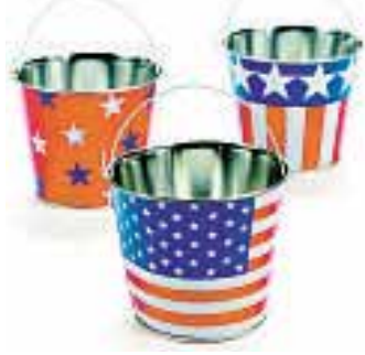
ORIENTAL TRADING COMPANY INC. Patriotic pails, $13.99 per dozen at ÔrientalTrading.com.

Whether setting a patriotic picnic or a red, white and blue buffet table, decorating options abound. And they can be as simple as adding American flag-emblazoned appetizer plates to your tabletop or embracing the look from the tablecloth to the tapers.