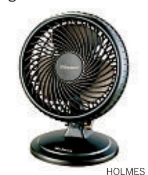
Holmes Lil' Blizzard 8-Inch Oscillating Fan ($16.63, amazon.com).

Juneja has used the Charly Little ($149.99, wayfair.com) in almost every house he's lived in because of the extreme windblowing power for its 12-inchdiameter. It moves 85,000 cubic feet of air per hour, cooling up to 220 square feet.