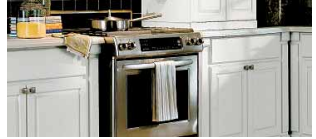
VENT-A-HOOD FROM NEW KITCHEN IDEAS THAT WORK (THE TAUNTON PRESS, 2012)

Every year, about 3.3 million dogs and a similar number of SEE DOG LOVER • E5