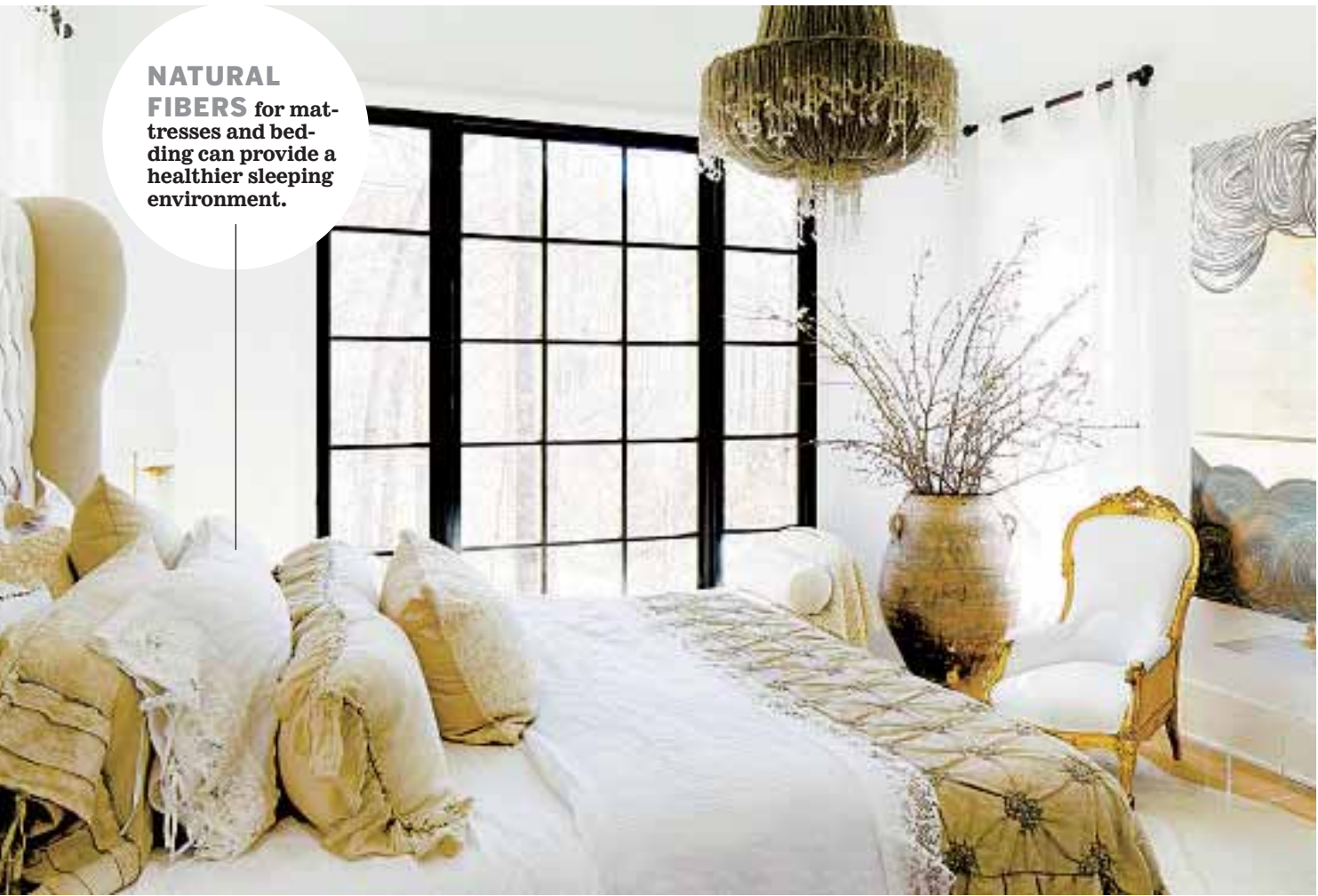
MALI AZIMA WELLNESS WITHIN YOUR WALLS