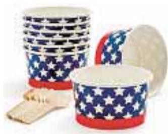
SUR LA TABLE

Buckets of style: Small buckets or sand pails in patriotic prints, colors or galvanized surfaces are a fun way to create easy summer centerpieces. Plant pails with flowers or succulents, use as vases for cut stems, or fill with sand and add red, white and blue candles, pinwheels or small American flags. Pails can also be a great way to contain festively colored paper straws, silverware, napkins, candy or nuts on a buffet