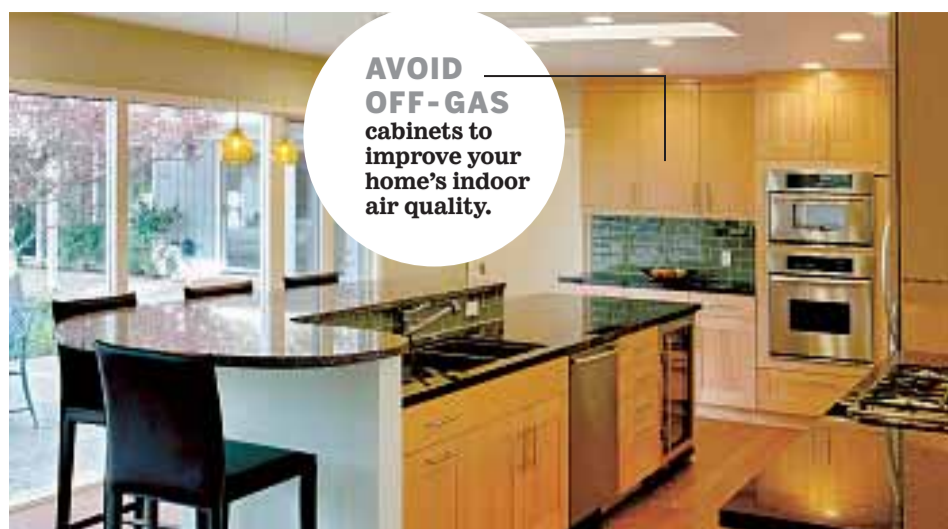
DOUGLAH DESIGNS INC. FROM NEW KITCHEN IDEAS THAT WORK (THE TAUNTON PRESS, 2012)

Roberts is a freelance writer for The Washington Post.