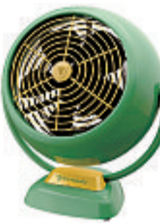
BED BATH & BEYOND

Holmes Lil' Blizzard 8-Inch Oscillating Fan ($16.63, amazon.com).