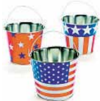
ORIENTAL TRADING COMPANY INC. Patriotic pails, $13.99 per dozen at OrientalTrading.com.

Whether setting a patriotic picnic or a red, white and blue buffet table, decorating options abound. And they can be as simple as adding American flag-embazoned appetizer plates to your tabletop or embracing the look from the tablecloth to the tapers.